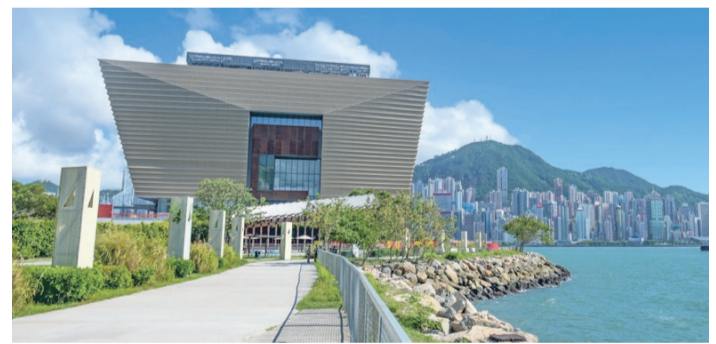
Hong Kong Palace Museum

The magnificent Hong Kong Palace Museum, featuring precious artefacts from the Palace Museum in Beijing, and M+, Asia's first global museum of contemporary visual culture, are the latest grand additions to the West Kowloon Cultural District, which is the emerging centerpiece of the city's arts and cultural development.