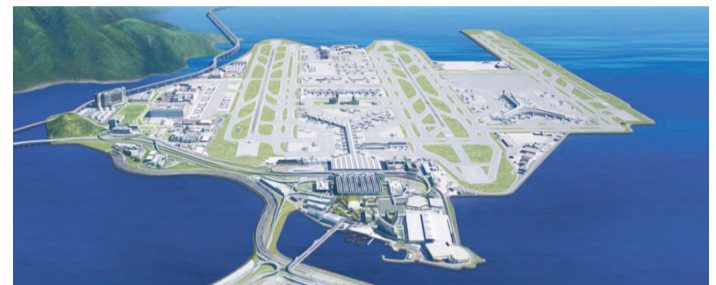
Three-Runway System at Hong Kong International Airport

Being the most open and internationally-connected city in the GBA, Hong Kong will make full use of its "One Country, Two Systems" advantages to become a world-class destination for people to live, work, invest, network and enjoy a high quality of life.